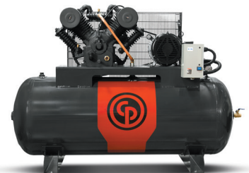
Two Stage Reciprocating Warranty - 2 Years